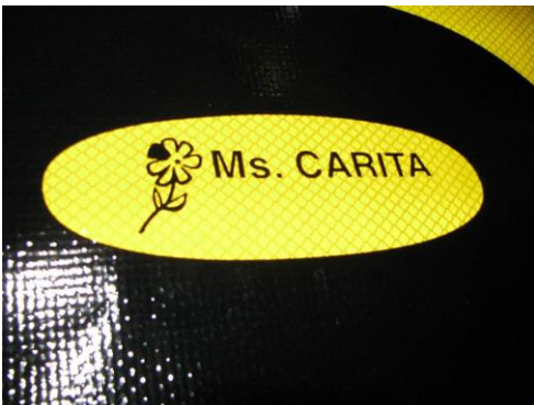
Close-Up Showing High-Intensity Reflective Vinyl w/Logo ▼